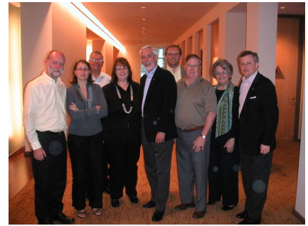
Global FM Board Members October 2006