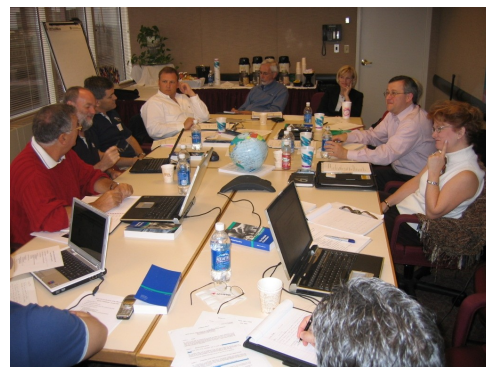
Global FM Directors Workshop Dallas 2005

Our other membership categories make various contributions appropriate to their scale of membership and type of organisation, again modelled on the basis to be as inclusive as possible and to reach out and encourage the whole facilities management community in its broadest sense to fully participate and join the facilities management worldwide community.