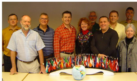
The Team working on the formation of Global FM October 2005

The intent from the beginning was to embrace the wider community, wherever it emerges, and to 'add value' to