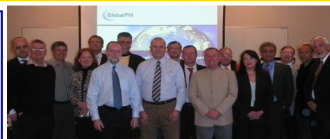
Attendees at International Workshop Oxford 2007

We have lent our support to a number of initiatives to establish new national facilities management associations and will continue to do so through our 'mentoring' programme encouraging the emergence of many new associations.